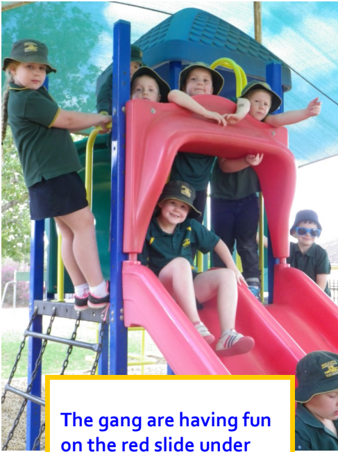
The gang are having fun on the red slide under the shade sails.

The children from grade P/1G are seeking out Sunsmart places to play in our school yard.