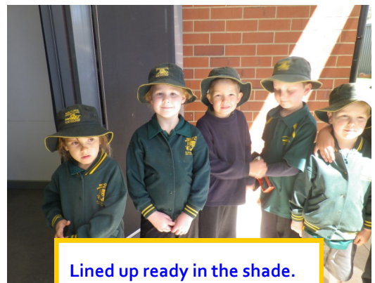
Lined up ready in the shade.